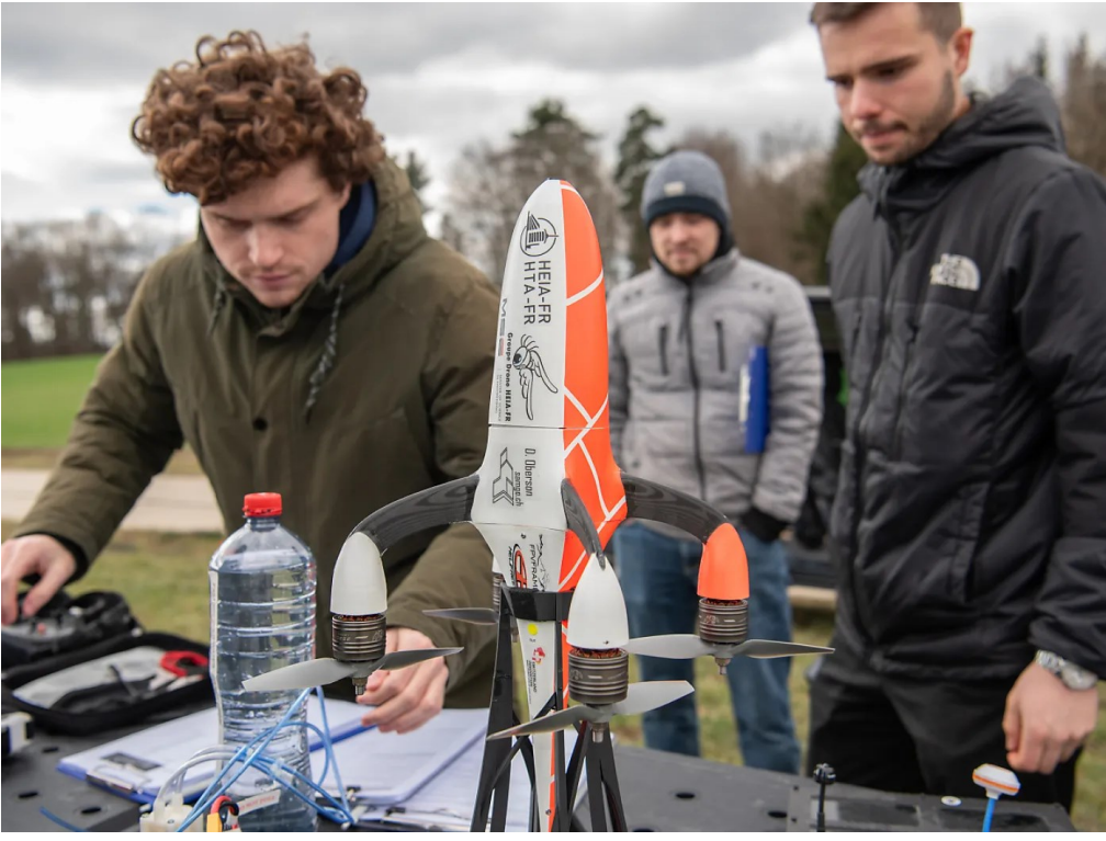
A student breaks a world speed record with his drone

to translate them into English. An editor then briefly reviews the translation for clarity and accuracy before publication. Providing you with automatically translated news gives us the time to write more in-depth articles. The news stories we select have been written and carefully fact-checked by an external editorial team from news agencies such as Bloomberg or Keystone. Did you find this explanation helpful? Please fill out this short survey to help us understand your needs: https://survey.survicate.com/d0df481d0b13412d/?p=anonymousExternal link